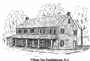
Village Inn Englishtown, N.J.